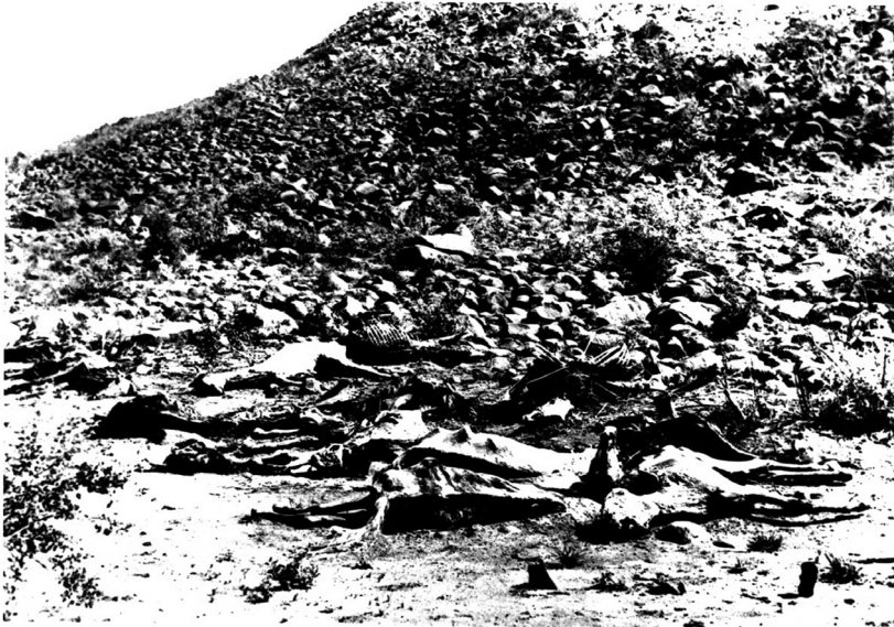
Figure 2. Bodies of horses after the Battle of Magersfontein 20

The war and contemporary writings helped propagate the idea of seeing and talking about the horse as an individual, with a personality and agency of its own. 21 It was arguably only with the advent of the racing industry from the beginning of the nineteenth century that horses began to acquire individual public personae in southern Africa. Race favorites became known and adored by the crowds. This was further fostered by military campaigns (for example in 1881 and 1899-1902), which facilitated the popularization of heroes, both human and equine. Leaders had iconic horses who became war-time celebrities in their own right: General De Wet's famous gray, Fleur, and General De la Rey's Starlight. 22 Lord Roberts's Arabian, Vonolel, who had carried him in campaigns in India, Afghanistan, and Burma, actually won service medals from Queen Victoria. The period also saw a florescence of writing on how to care for horses, with greater focus on the horse's own agency and personality (Fleming, 1889).